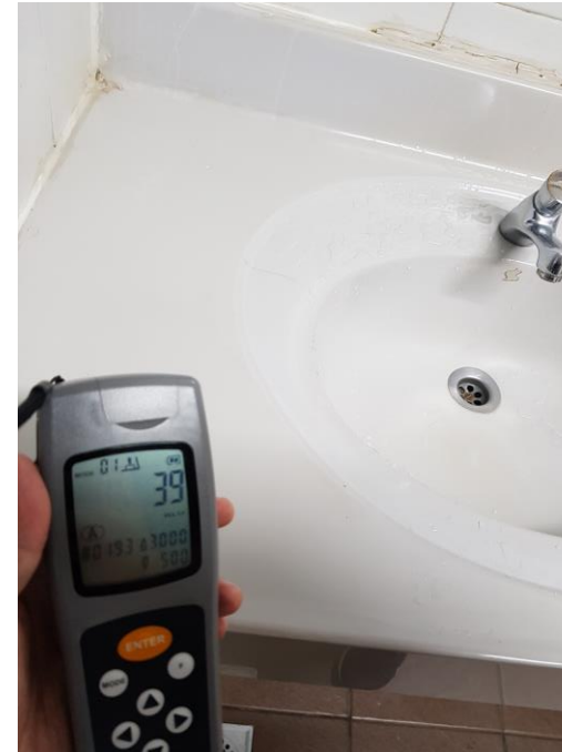
Ward 32B (DMT Toilet) Basin (Bottom-left Corner)