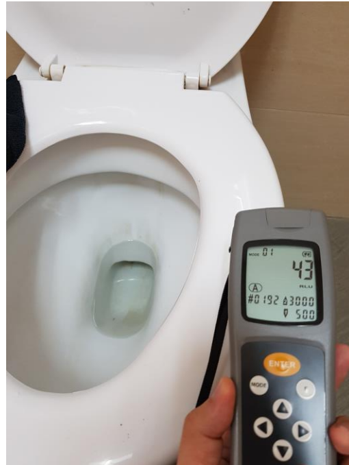
Ward 22B (DS Toilet) Last Cubicle (Seat Cover)