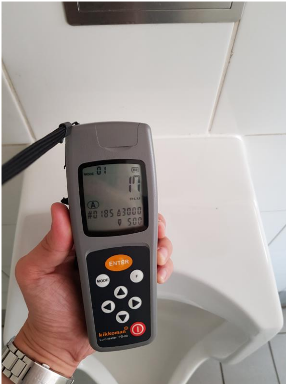
Ward 54A (DS Toilet) Last Urinal (Top Ledge)

Quarter 2 Results (Pre-cleaned) – 6 Months after treatment