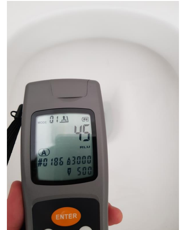
Ward 54A (DS Toilet) Toilet Inner Bowl (Water- Washing Only)