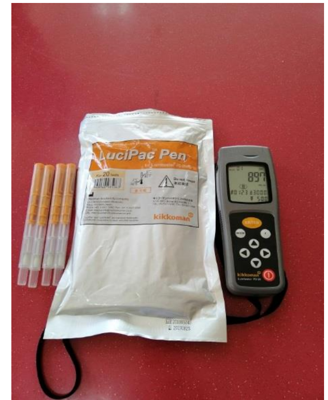
Kikkoman Lumitester and LuciPac Pen (ATP Tester)