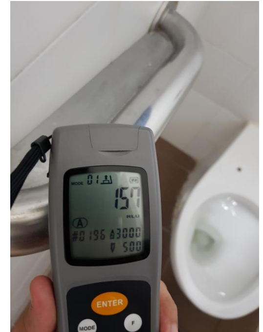
Ward 32B (DMT Toilet) First Cubicle (Grab Bar)

Quarter 2 Results (Pre-cleaned) – 6 Months after treatment