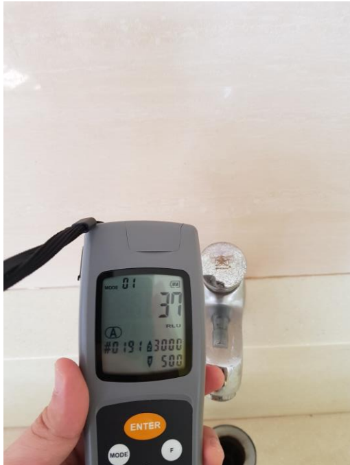
Ward 22B (DS Toilet) Basin Tap (Centre)