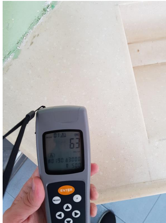
Ward 54A (DS Toilet) Basin (Bottom Left Corner)